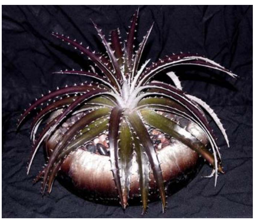
CBS Meristem March 2011