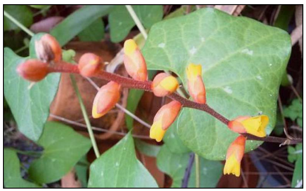
CBS Meristem March 2011