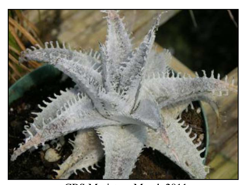
CBS Meristem March 2011