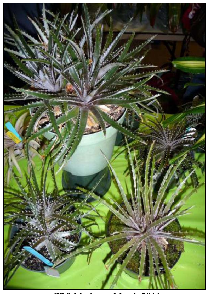
CBS Meristem March 2011