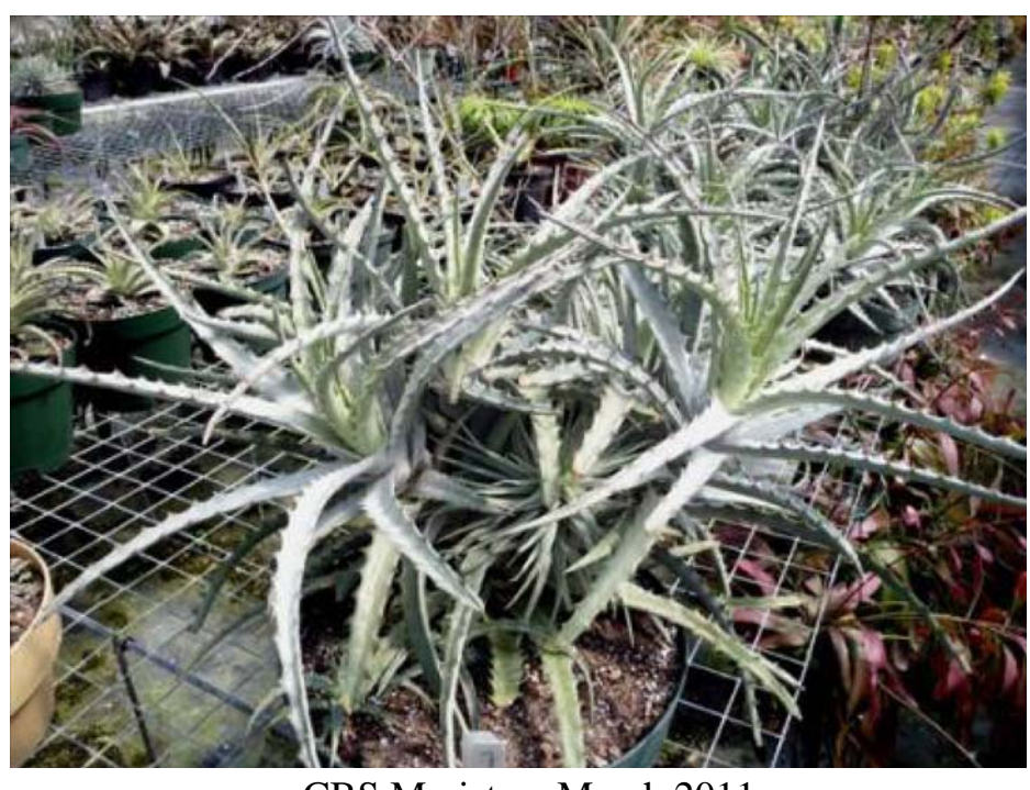
CBS Meristem March 2011