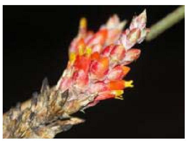
CBS Meristem March 2011

interesting combination of coral colored bracts and This large yellow petals. clump of Dyckia "Big Blackie" (an unregistered hybrid) (not shown)demonstrates the nature of the flower spike prior to its more typical mature appearance of clusters of bell like flowers. Although it can"t be appreciated in this photo, one of the characteristics, which help distinguish dyckias from hechtias is that the inflorescence develops from the base of the lower leaves rather than the center of the plant as in the case of plants of the Genus: Hechtia. Also as seen in the picture on the opposite page, the dyckia spikes are minimally branched, while the spikesare mostly multi-branched with hechtias.